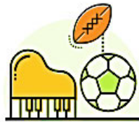
Arts, Media, and Entertainment