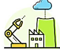
Manufacturing and Product Design