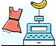
Marketing Sales and Service