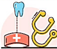
Health Science and Medical Technology