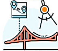
Engineering and Architecture