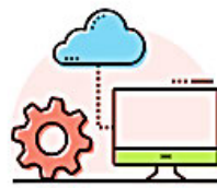
Information and Communication Technologies