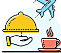
Hospitality, Tourism, and Recreation