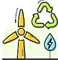
Energy, Environment, and Utilities