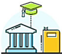
Education, Child Development, and Family Services