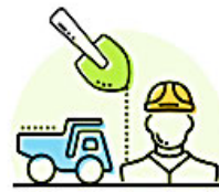
Building and Construction Trades