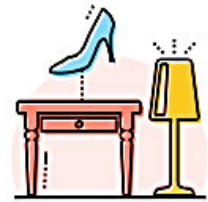
Fashion and Interior Design