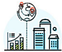
Business and Finance